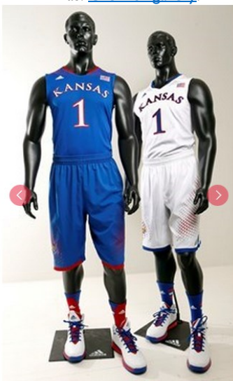
ADIDAS MADE IN MARCH UNIFORMS